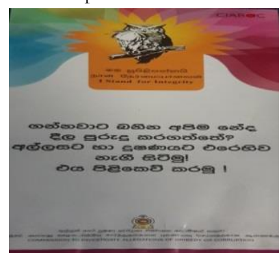
Page 5 of 6