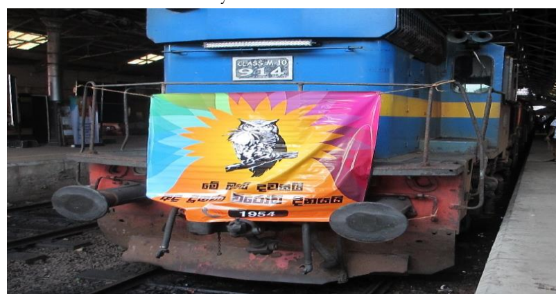
Page 4 of 6

An array of activities ranging from engaging with the public, distribution of leaflets and comic books, conducting raffle draws and competitions,