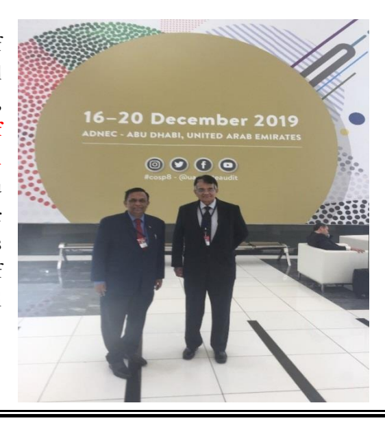
Page 3 of 6